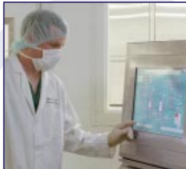
RTI team member controls the BioCleanse® tissue sterilization process, which removes bacteria, fungi, spores and viruses.