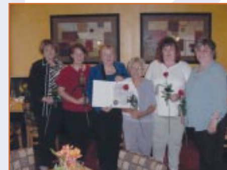
Donor family members came together in 2004 to assist with donor awareness projects.