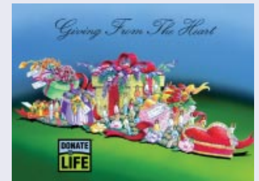
"Giving From The Heart" is the theme of the Donate Life Rose Parade Float, which includes the Family Circle Garden, located at the front.

The 2007 parade will take place at 8 a.m. Pacific Standard Time Monday, Jan. 1. ♥